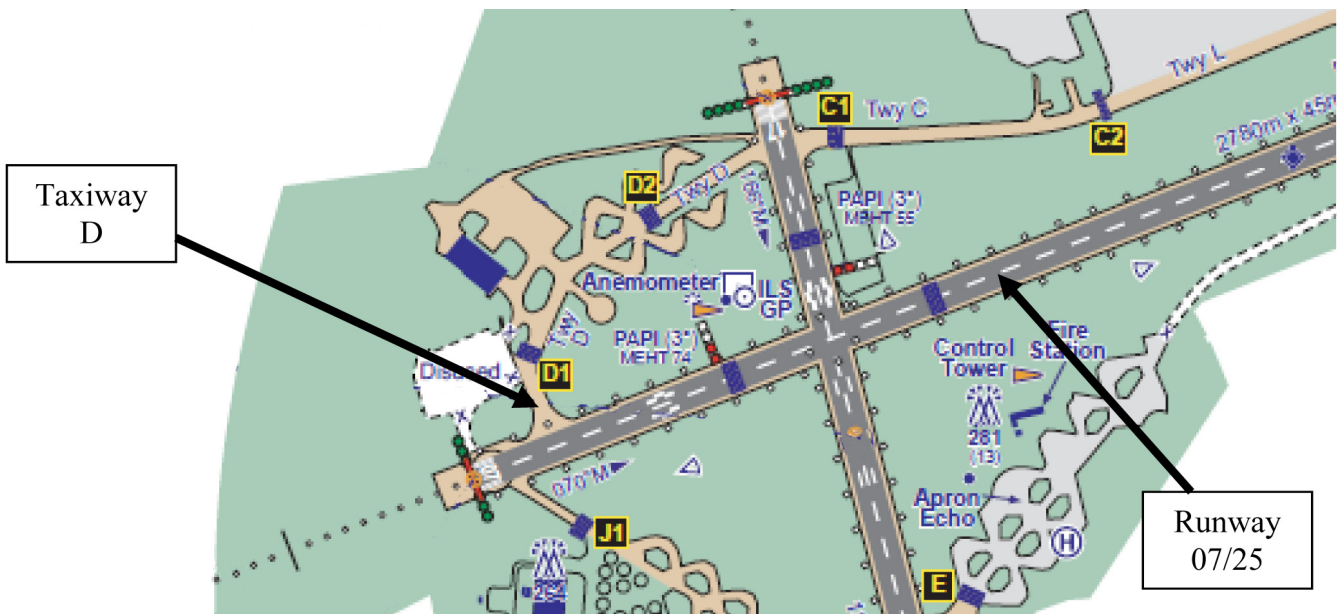
Figure 1 North-western area of Belfast Aldergrove Airport

Shortly after this, a smoke-like substance started filling the cabin from the overhead vents. Passengers and crew, interviewed after the event, described the smoke appearing along the entire length of the cabin, and that it was either brown or black in colour. It was impossible to ascertain precisely the volume or density of the smoke but crew and passengers reported that visibility was affected. They described the smell as being reminiscent of a bonfire or electrical burning.