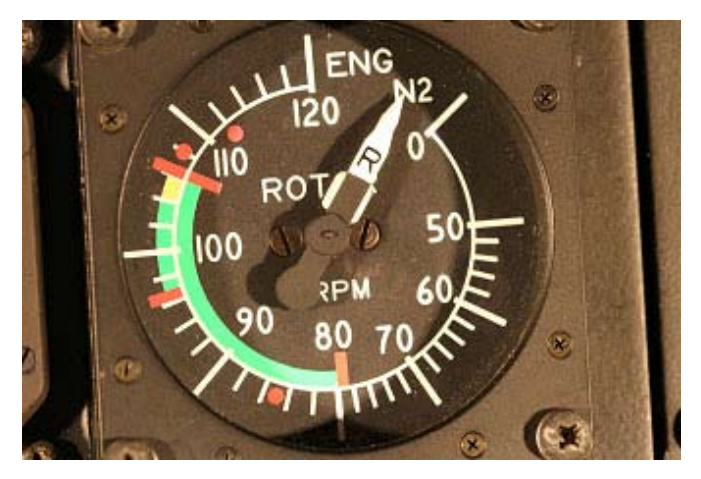
The two N2 pointers are below the NR pointer in this photograph of the gauge at rest. Note the tail of the NR pointer.

The pilot would have been naturally concerned about rotor rpm, and did interrogate the triple tachometer gauge (see Figure 2). However, controlling the helicopter attitude and selecting a suitable landing site would have demanded most of his visual attention during the short time available and so it is likely that he only gave the gauge a brief glance.