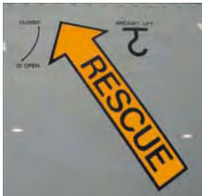
Military aircraft rescue markings

For the purpose of rescue, the location of access doors, hatches, break-in points and cut-out panels are generally indicated on the external surfaces of military aircraft by a yellow arrow, bordered black.