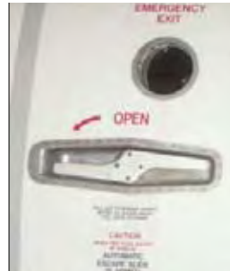
Typical external door handle

The position of emergency equipment on aircraft, which is accessible from outside the aircraft, is generally indicated by a silhouette with an associated written description. Where a first-aid kit is carried, its marking will be found adjacent to an access panel or exit from which the kit is accessible.