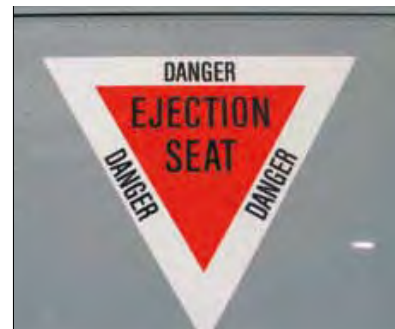
Ejection seat warning on Military aircraft

Under normal circumstances, the words “EJECTION SEAT” contained in a bright red inverted triangle, located on either side of the cockpit fuselage is an indication that the aircraft is fitted with ejection seats.