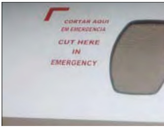
Emergency cutting area on aircraft fuselage