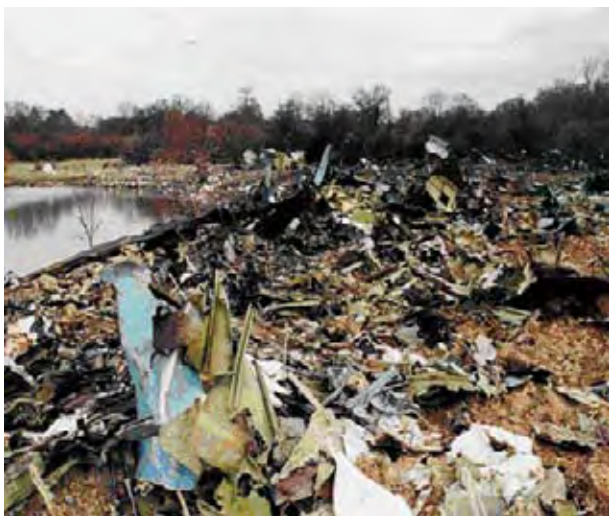
Example of an aircraft accident site