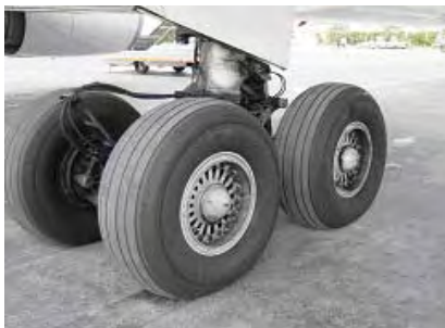
Commercial aircraft tyre pressures can exceed 250 psi

These assemblies can explode with devastating violence, particularly if fire has occurred. Tyre assemblies are best approached from fore or aft.