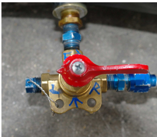
Figure 5 Fuel selector in OFF position

The fuel selector and its placard made it difficult to confirm which tank had actually been selected and the pilot had discussed the fuel selector indication at length with another pilot prior to his departure. The placard is also misleading in that there is only one detented position for the front tank and one for the rear tank and not an arc of 90° as indicated.