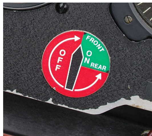
Figure 6 Fuel selector placard