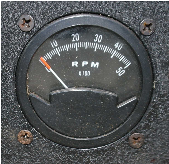
Figure 4 Rpm gauge