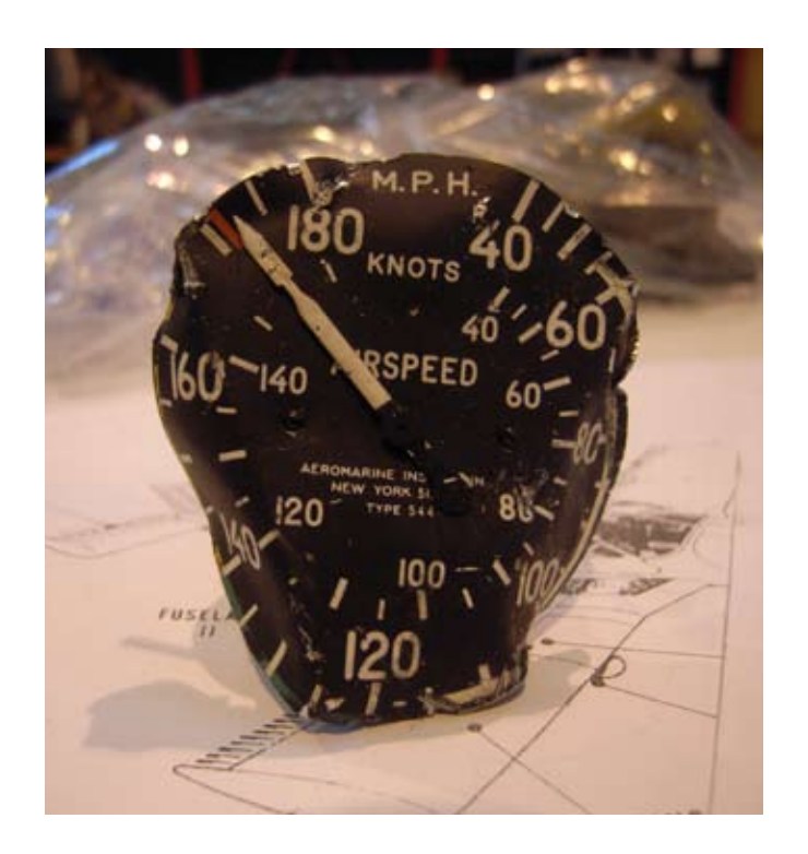
Figure 2 Face of airspeed indicator (ASI)

The aircraft held a non-expiring Certificate of Airworthiness (C of A) issued on the 19 March 2008 and an Airworthiness Review Certificate (ARC) which was valid until 17 March 2009.