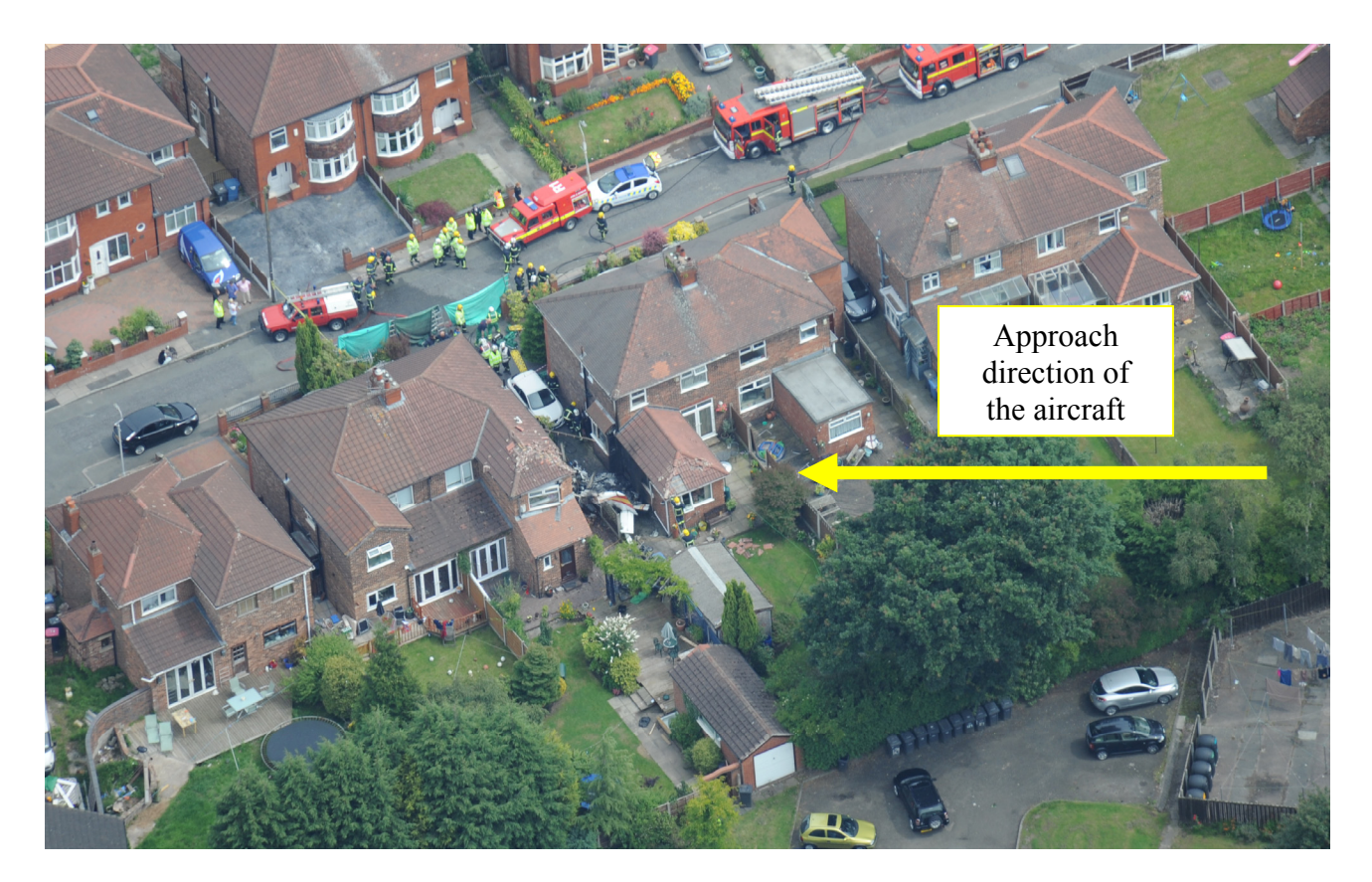
Figure 4 Accident site

The aircraft was recovered from the accident site for detailed examination. The engine was removed from