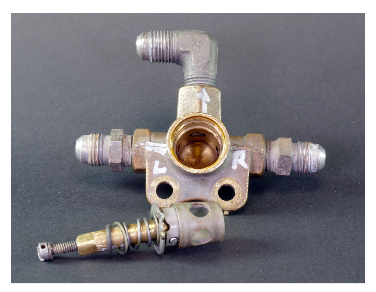
Figure 2 Fuel selector valve (valve cap removed)