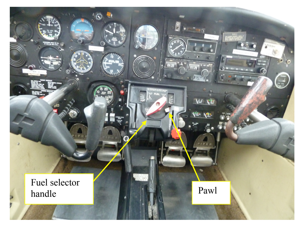
Figure 1 Fuel selector handle in the OFF position

tank and one which passes through the firewall to deliver fuel to the engine. The stem of the valve is attached to a plastic plug with two holes in it, which rotates within the body of the valve. When the valve is in the OFF position the plug blanks off the engine delivery pipe. When the plug is rotated to select the left tank, the holes line up with the pipe from the left tank and the engine delivery pipe to allow the fuel to flow. Similarly when rotated again to select the right tank, the holes line up with the engine delivery pipe and the pipe from the right fuel tank. The top of the plug has four recesses aligned in a cross shape. Above this is a spring-loaded, non-rotating washer with a ridge across its diameter. In each of the defined positions of the valve, the ridge in the washer slots into the recesses on the plug, providing a positive detent to give tactile feedback that the holes in the plug are correctly orientated with the feed and exit pipes (see Figure 2).