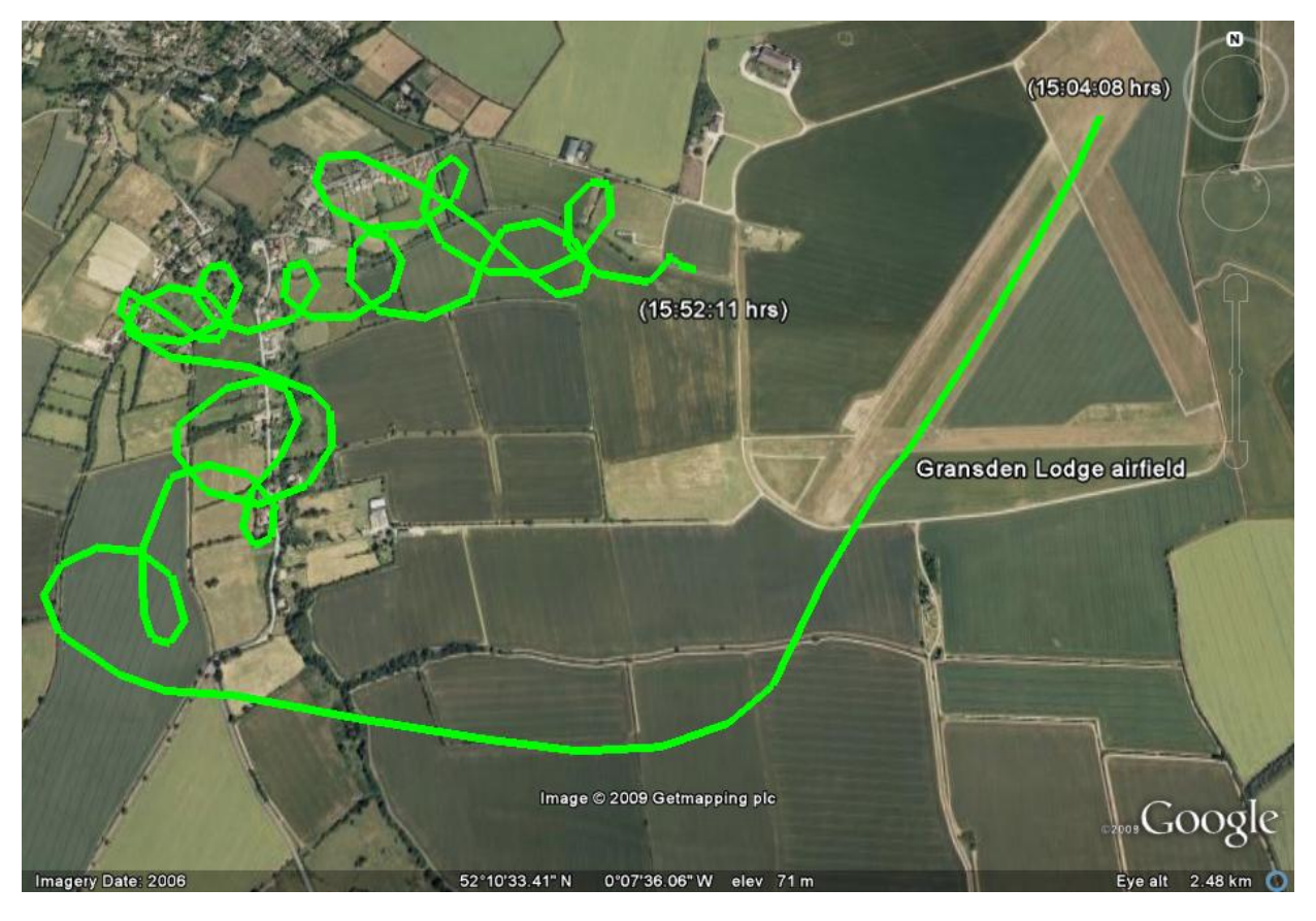
Figure 1 GPS track of G-CHOM

The pilot learned to fly with a University Air Squadron in the mid-1960s, before training as a commercial pilot and working for a number of airlines, flying jet aircraft on international routes. On his retirement from professional flying, he took up gliding and undertook his first solo glider flight (in a K21 glider) after 17 launches. He then converted onto the Junior single-seat glider followed by the Discus. Instructors who flew with the pilot described him as having good, accurate flying skills and exercising very sound judgement, consistent with his background as a professional pilot. He was developing his ability to find lift and maintain soaring flight for extended periods but most of his