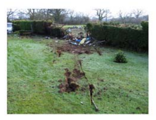
Figure 2 Initial impact site (hedge trimmed by main rotor)

It was evident that the main rotor had sliced through the top of the hedge (see Figure 2) and there were also slash marks on the ground either side of the hedge where the main rotor had hit. The main rotor mast had broken just below the rotor head and the main rotor blades, still connected to the rotor head, were found resting against a tree 90 feet beyond the main wreckage. The tail rotor and tail rotor gearbox were found 10 feet beyond the main wreckage. One tail rotor blade was damaged but complete and the other tail rotor blade had broken into two pieces. The outboard section of this blade was found 230 feet away from the aircraft initial impact point (ahead of and to the left of the wreckage trail centreline) while the inboard section of the blade was found close to the initial impact point.