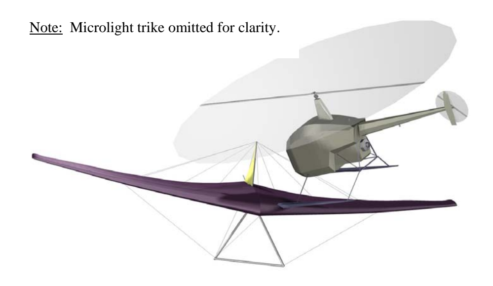
Figure 2 - Representation of the two aircraft immediately prior to impact